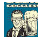
Scientists Discover 'Beer Goggle' Formula...